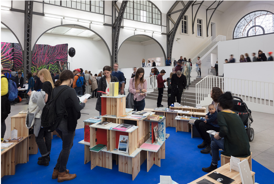
Photo: Lorenzo Sandoval, "Broken Parliament Vol. V", 2017, installation view

The festival features exhibitors from all over the world, with a wide representation of publications ranging from home-style zines to fully-fledged magazines and hard-cover books. What are the conventions – if there are any – of an "art book"?