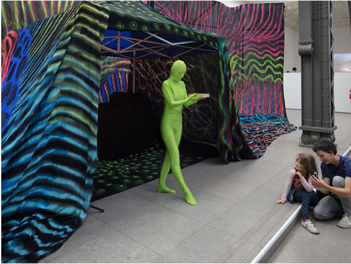
Photo: Karma Clarke-Davis, "FUTURE. TRANSGRESSIVE.", 2017, installation view and performance